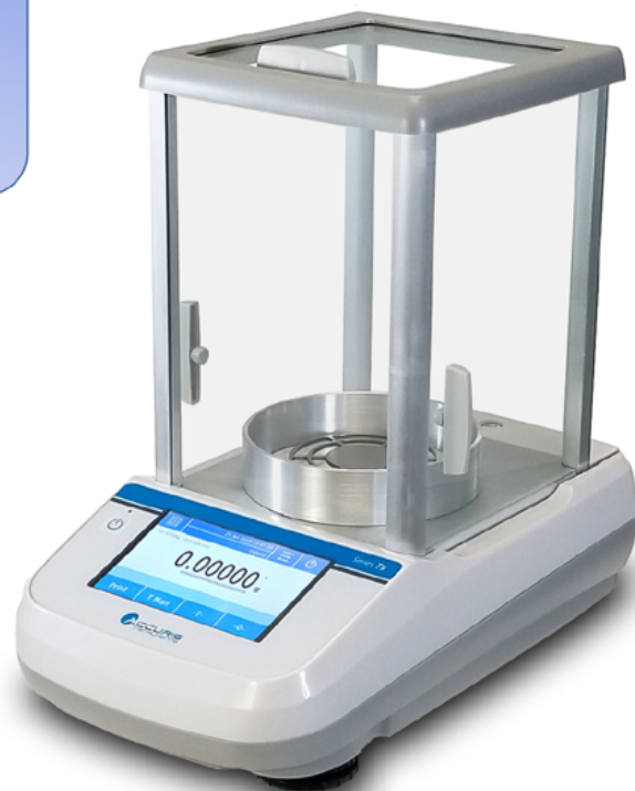
W3002A-120 Semi Micro Balance With Color Touch Screen

Readability: 0.1mg or 0.01mg Capacity: 120g or 220g