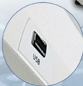
USB Port for flash drive connection