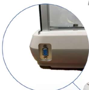
RS232 port for Printer and PC connection

Series Tx models have adjustable feet and a leveling bubble to ensure correct installation. Note: For optimal weighing performance, the Tx semi micro model must be installed on a suitably stable surface such as a marble slab table.